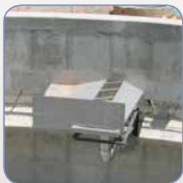
Scum Box (OPTION)